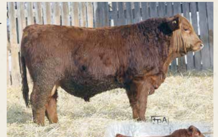
GRAND SIRE C57

A lot of good genetics behind this guy, Fireball sired herd sire prospect as well as a Crown Royal dam. He has loads of dark cherry red hair which covers a thick hipped, deep ribbed body structure. He for sure will work well on a cow herd with all his performance.