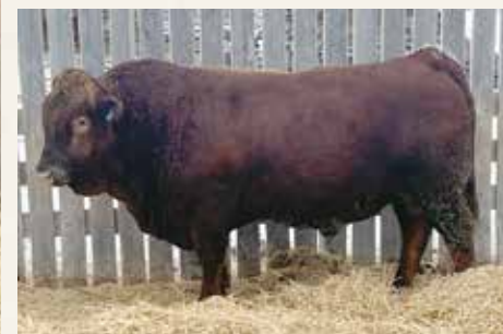
SIRE CMK GAGE

A homozygous polled, Purebred, CMK Gage son, out of Jen-Ty Honey Comb 514H. This early maturing herd sire prospect has developed with a lot of eye appeal and balance. He came to the weaning pen with an actual weaning weight of 764. He is the kind that is sure to add extra weight to your calves in the fall so they will stand apart from the crowd both in muscle and length of body. Make sure to add him to your short list on sale day.