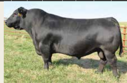
GRANDSIRE SAV RESOURCE 1441Y