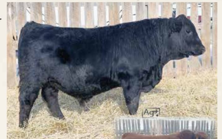
SIRE FIRE BALL 27F

Good solid, Black, well-made herd sire. Bluesman has a good strong pedigree, his dam Jen-Ty Elizabeth 131E is a very broody female and her dam Jen-Ty Coco 733C, is just one of those consistent females that produce stand out calves every year that really work and have tremendous performance each fall. He has loads of hair that covers an exceptional body structure. Very Fleshy, long sided, good footed as well as being very eye appealing are some of his traits.