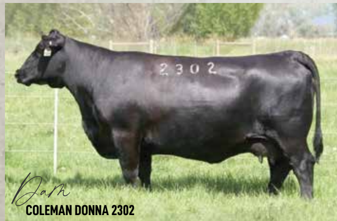
Dam COLEMAN DONNA 2302

What an impressive moderate framed, herd bull that has so much muscle mass & volume. He is quick to catch your eye. An ET calf we raised, sired by the great SAV Resource 1441Y who has sired many great progeny all over North America & his dam Coleman Donna 2302 who is just a powerhouse in herself. The mating of these two have proven to have built a tremendous, volumous herd bull here with High Roller. He fits our program well with all the right traits he portrays.