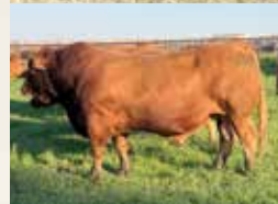
SIRE FIRE BALL 27F