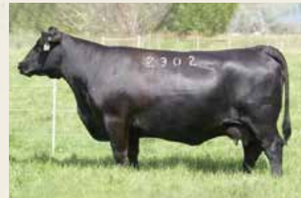
GRAND DAM COLEMAN DONNA 2302

Without a doubt one of the most uniquely designed homozygous polled, Balancer Gelbvieh bulls in this year's offering. Great disposition. A true beef bull that offers unmatched shape and expression and muscle mass as well as eye appeal. Just a meat machine. Sired by Jen-Ty High Roller 1HET out of the great SAV Resource 1441Y & Coleman Donna 2302Z as well as one of our top Gelbvieh females Jen-Ty Deeanna 827D. An actual weaning weight of 1000 pounds. Performance standout that will add true value in the form of pay weight on your calves. We are sure he will have lots of friends on sale day, so make sure to check him out.